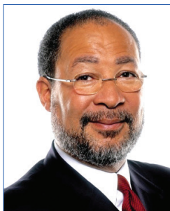
Richard D. Parsons,

Senior Advisor, Providence Equity Partners, Inc. (Chair of the Task Force)